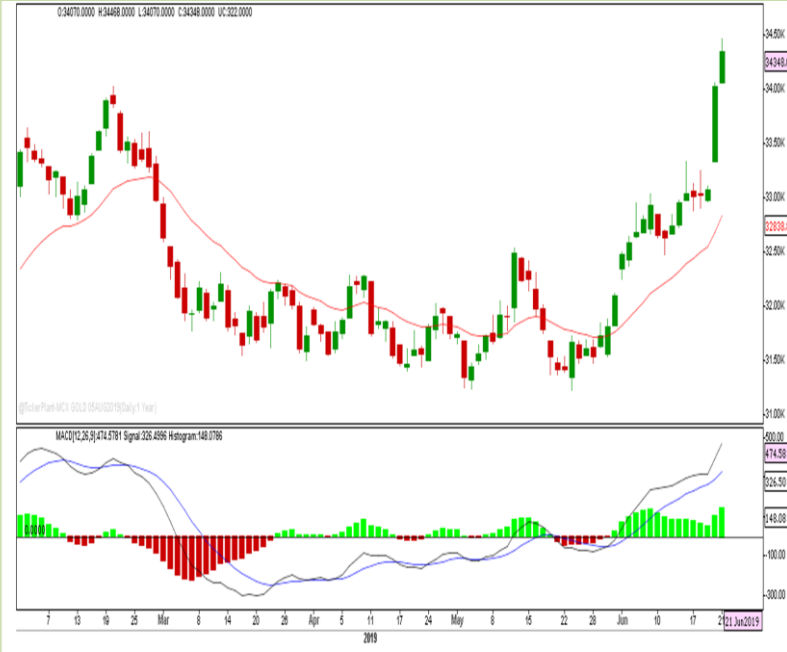
MCX GOLD AUG – CMP 34346